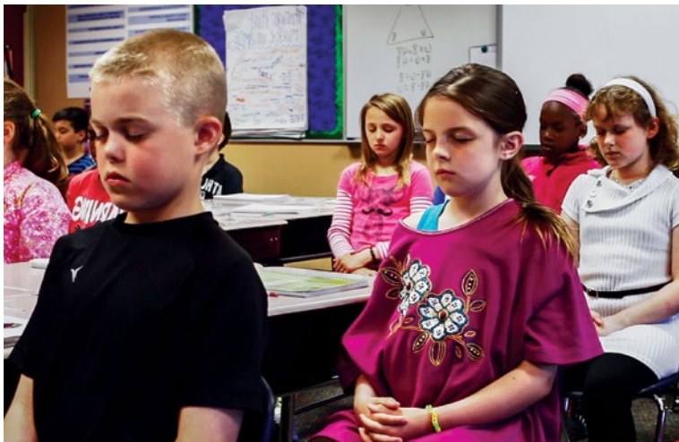
As part of the Inner Explorer program, children learn to slow themselves down and regulate their emotions.